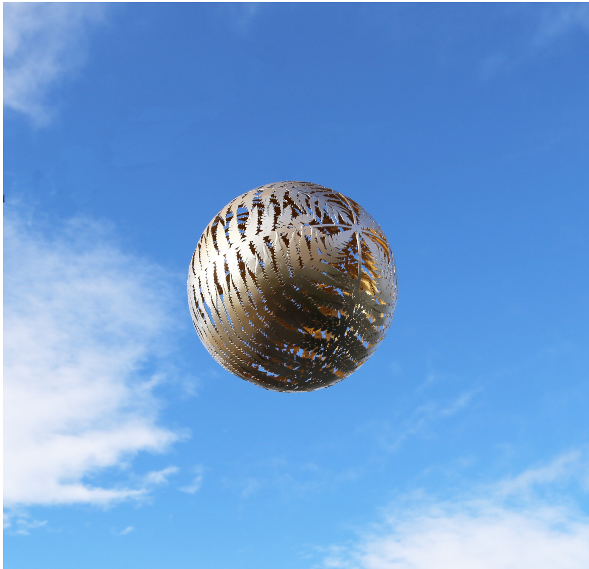
Ferns II, Maquette

Details about the fund-raising are on our website: sculpture.org.nz/news-and-events/news/giving-ferns-a-boost