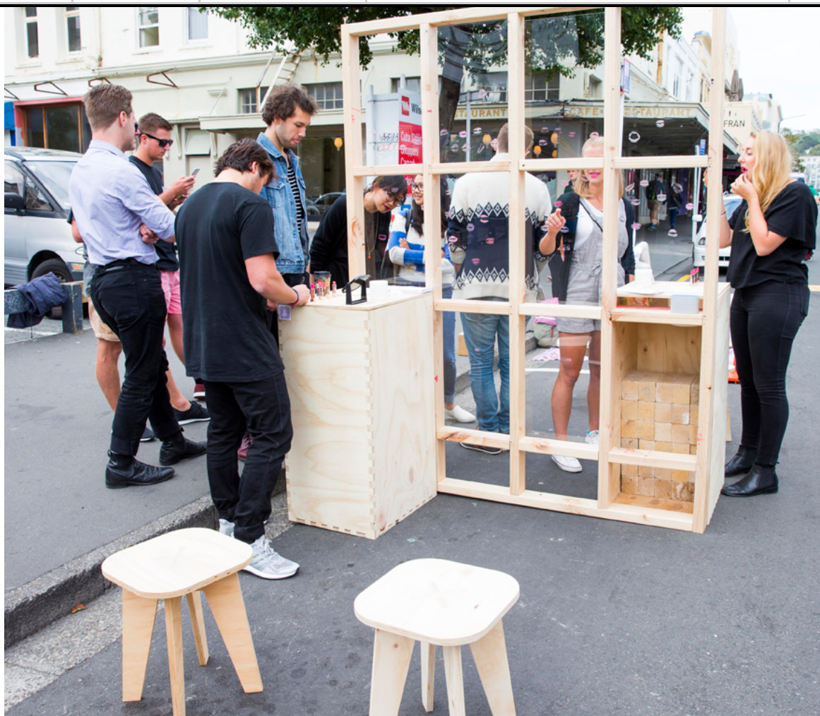
Pecking Space, SAANZ, 2016