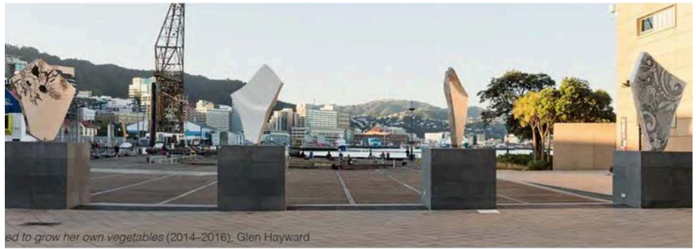
ed to grow her own vegetables (2014–2016), Glen Hayward