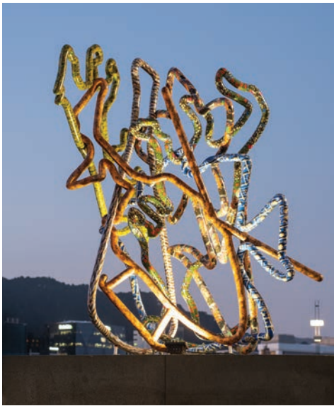
Signal Forest (2020), Yolunda Hickman.