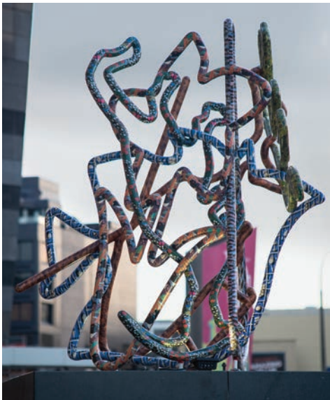
Signal Forest (2020), Yolunda Hickman.