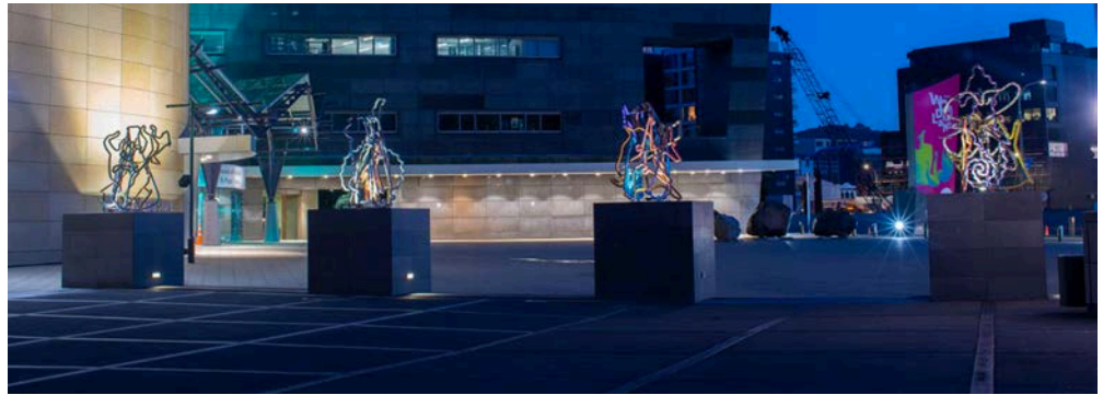
Above: Rita Angus used to grow her own vegetables (2014), Glen Hayward