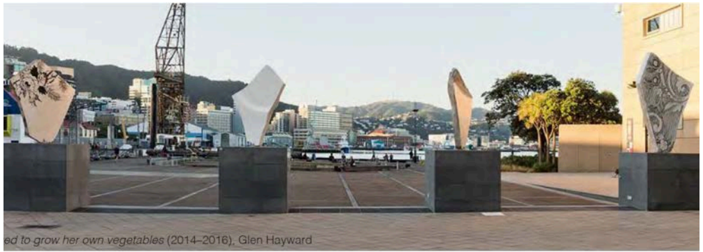
ed to grow her own vegetables (2014–2016), Glen Hayward